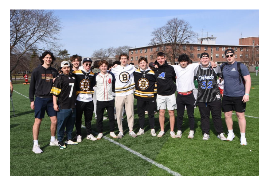
Farewell to the Class of 2024!

Friday, April 12th was the last day of classes for seniors. With the hard work behind them, the boys celebrated their final days on Morrissey Boulevard with a week of festivities including the Senior Olympics , Co-Curricular Awards , and more. Congratulations, gentlemen! Wishing the Class of 2024 all the best in their next chapter as they join the illustrious ranks of BC High Alumni!